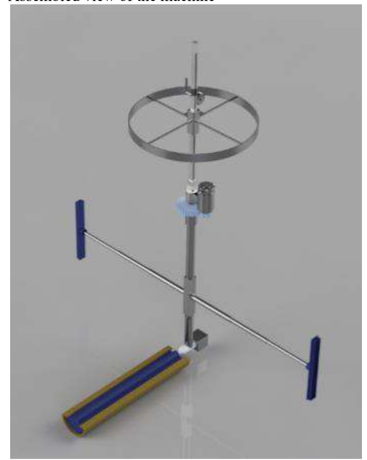
Fig. : Assembled view of the machine